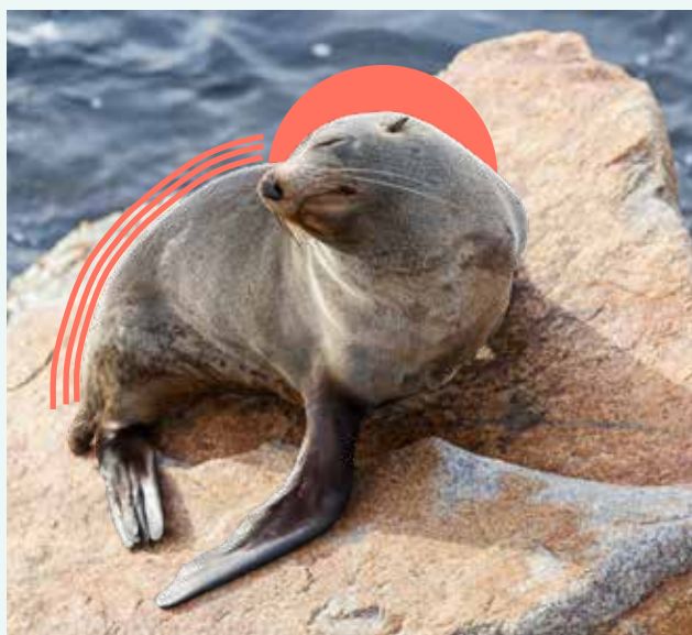
NAROOMA . SAPPHIRE COAST